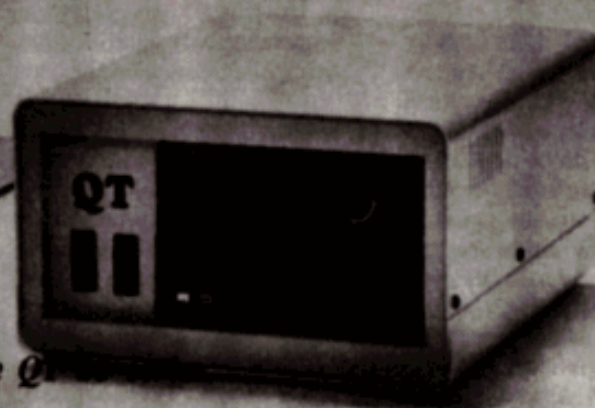
The QT Plus

The QT family of multi-user, multi-tasking computers supports from 4 to 20 users. Currently 9 models are available, ranging in price from $ 1,595 to $ 8,795. Models are available with the Motorola 68008, 68000 or the new 32 bit 68020 CPU. CPU speeds range from 8 Mhz to 16.67 Mhz; RAM size from 128K to 2048K and ROM from 2K to 256K. All the QT 's have a built in SASI interface and will support any hard drive. All QT 's include OS9/68K, the multi-user operating system with Basic, utilities, word processing and spreadsheet programs. The QT 's take up less than one cubic foot of space.