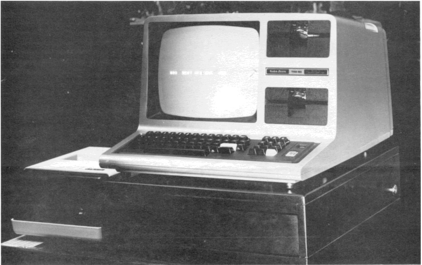
The CR-180 Point of Sale Package is shown here in a Best Western Motel.